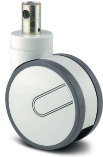
Our high precision castor Integral twin torsion