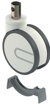
Cable catcher with e.g. Integral twin

We understand the importance of standstill casters for medical robots. This is why we recommend our Integral twin torsion casters which, when locked, do not allow any play and remain solid in position.